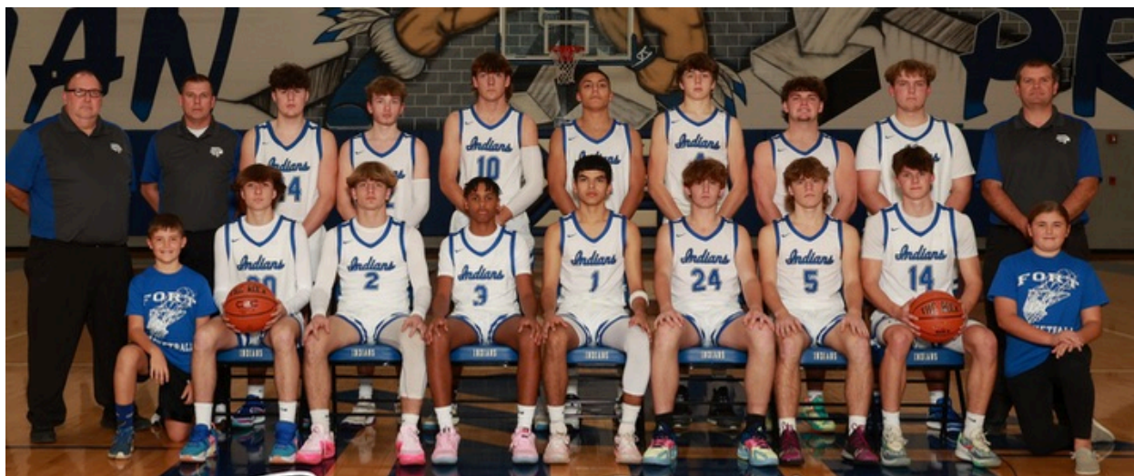
Roster Fort Defiance Basketball - Boys Varsity